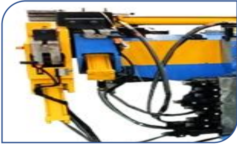
Hydraulic oil pipe clamp