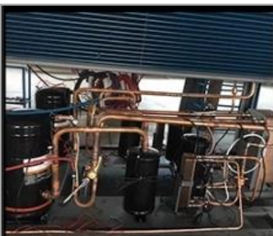
Air conditioning duct