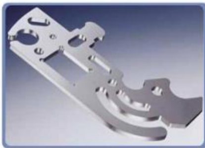
Stainless Steel Cutting

Widely used in Metal industry manufacture kitchen appliance, electrol Control box, Electromechanical equipment, Optical equipment, Hardware equipment, Elevator Manufacturing, Auto parts, Display device, hardware. And metal processing , Advertising design, decoration, gifts, thin metal crafts, electronics, electrical appliances, household appliances, instrument processing and other manufacturing and processing industries.