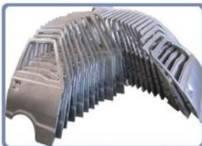
Auto Spare Parts