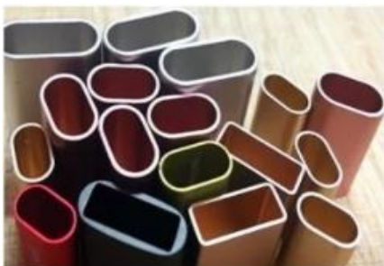
Metal Tube Cutting

Metal tube fiber laser cutting machine widely used in furniture, medical equipment, fitness equipment, oil pipelines, exhibition equipment, engineering machinery, bus manufacturing, locomotive manufacturing, agricultural and forestry machinery, bridges, ships, structural parts, household appliances manufacturing and other industries.